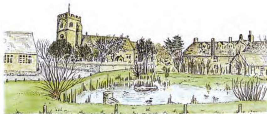
The Village Pond Ducklington

Annual Church Wardens Vestry Meeting, Thursday 7 th April 2016 in the Village Hall